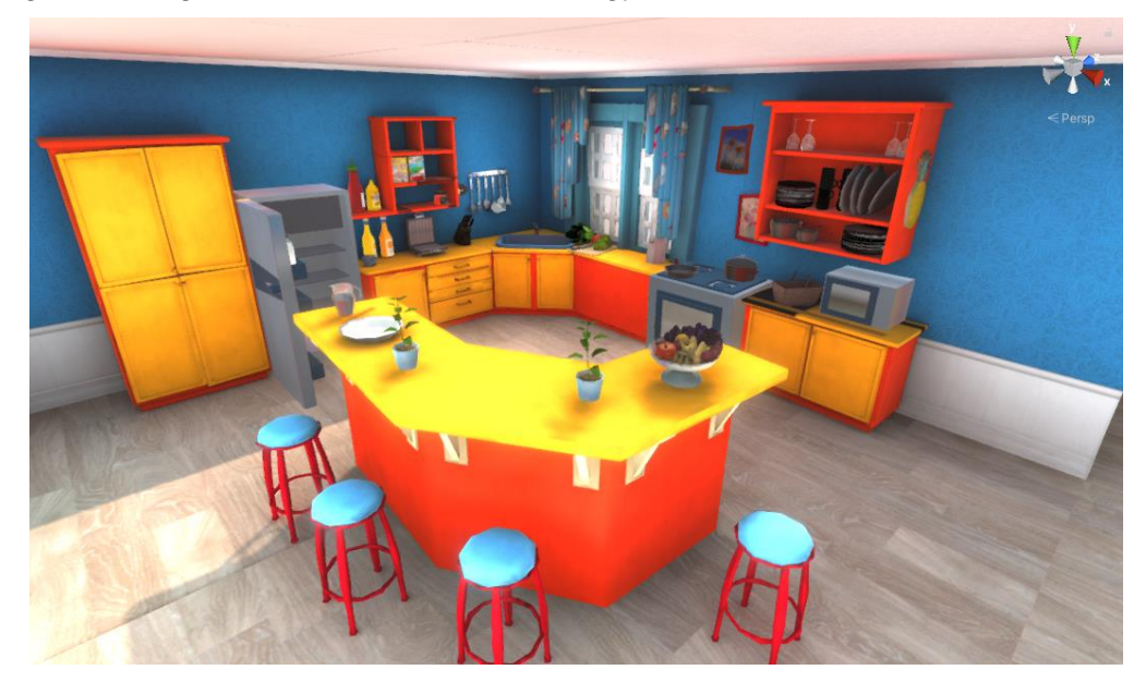
Figure 4: photo of the Hero's kitchen

When he chooses the product it will be good to look with a photo that helps him. E.g. milk, yogurt - strong bones, bread, cereals - energy, fruit – vitamins