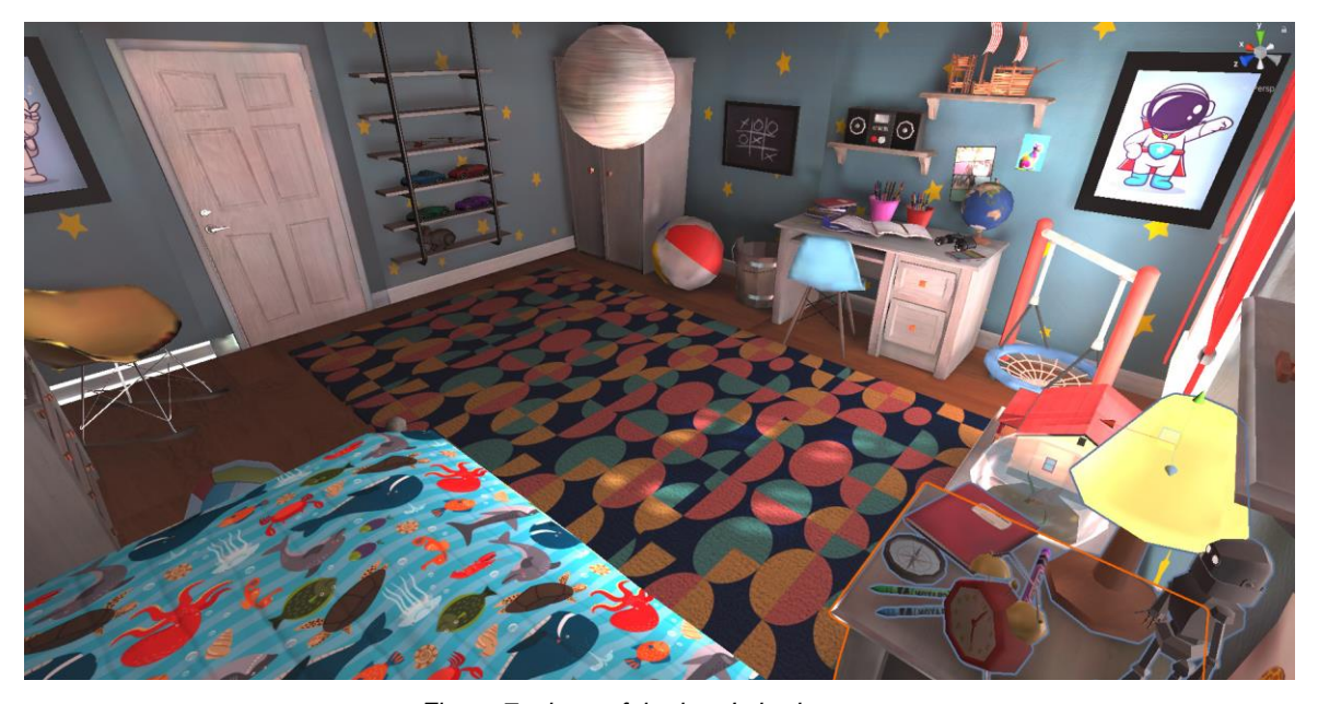
Figure 7: photo of the hero's bedroom