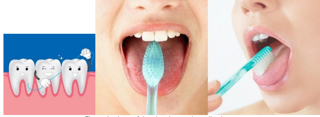
Figure 3: photo of the cleaning teeth application

Brush 2-3 teeth at a time, counting to 10 (about 10 seconds). I clean the tongue.