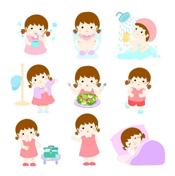
Figure 2: photo of the activities