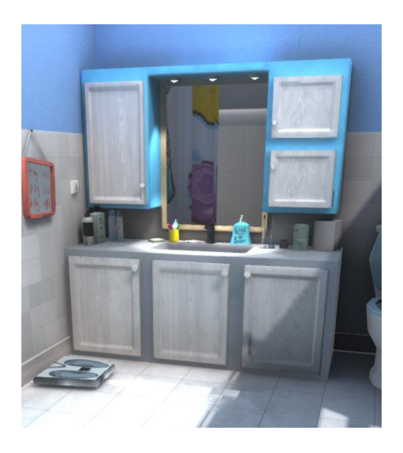
Figure 1: photo of the Hero's bathroom