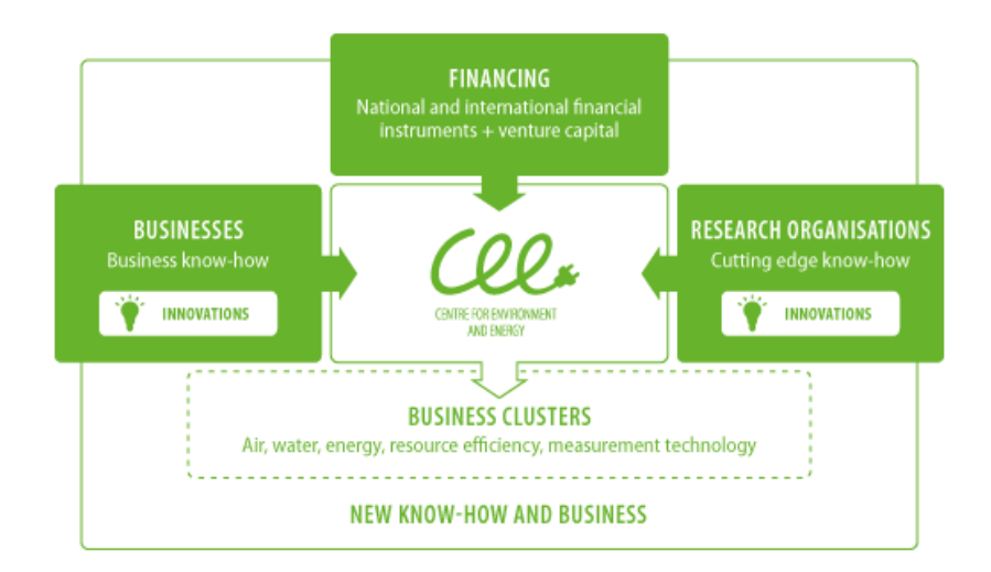
Figure 3. Eco-Innovations – a brand for Oulu

We will give wings to innovations – air, water, energy, resource efficiency and measurement technology can be turned into functional products. That's what we are here for. We will head for the international arenas right away. The water alone holds a billion euro market. Our goal is to make eco innovations and green economy a brand for Oulu. You, Oulu and Finland can be the global forerunners.