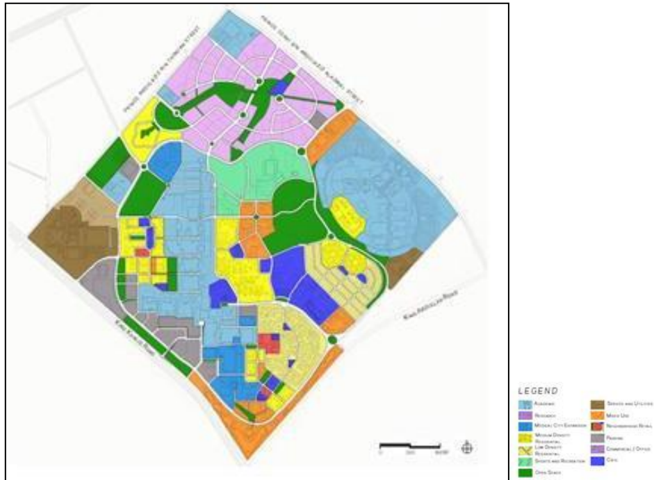
Figure (5): Proposed Land Use Plan

To maximize the efficiency of infrastructure, define distinct characters for different districts and neighborhoods and create a high quality of life for the campus, land uses were distributed into thirteen different categories: academic; research; medical city expansion; medium density residential; low density residential; sports and recreation; open space; service and utilities; mixed use; neighborhood retail; parking; commercial / office; and civic