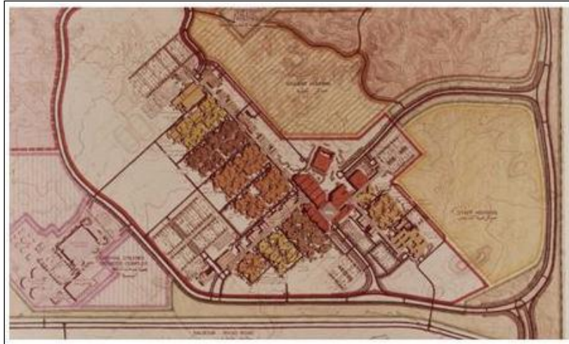
Figure (1): The First Version KSU Master Plan

Figure shows (2) the development of the KSU campus from the time of its inception until today. Mapping these patterns of growth provides an idea as to whether there is a need to rethink the future development strategy of the campus.