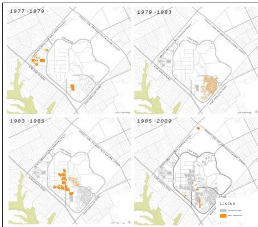
Figure (2): KSU Development Timeline

However, in the last twenty years there have been a relatively limited number of projects that have been carried out. These projects include the play fields and Sports City, the Department of