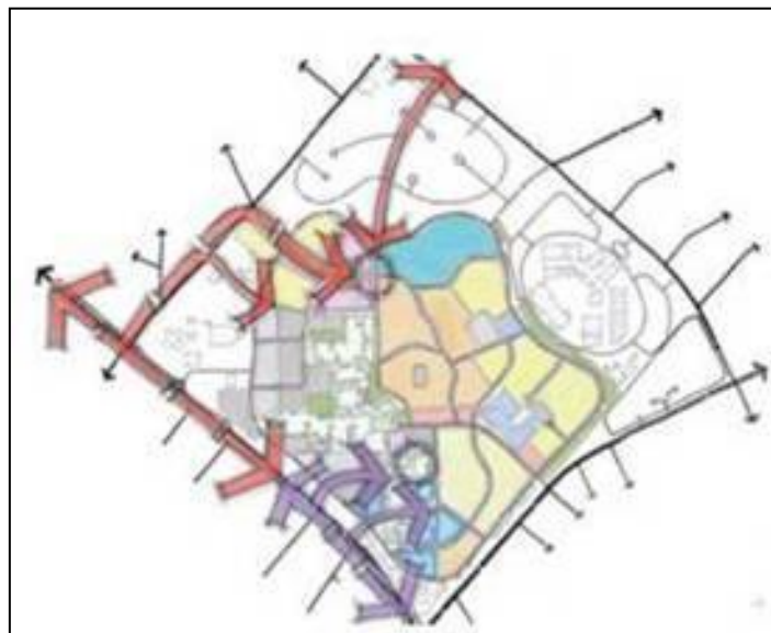
Figure (4): Concept Development

The preferred plan was developed, which was a combination of the three concepts. The selected master plan was approved in 2009 by a higher review committee. The plan was further refined and developed to focus on connectivity between various districts, the architectural character of those districts, landscape and open spaces of the University. Suggestions and recommendations of the KSU team and other stakeholders that participated throughout the planning process were incorporated in the final master plan. Through regular updates and the creation of a Design Review Board (DRB), a framework for the implementation of the master plan was also laid out (see Figure 4).