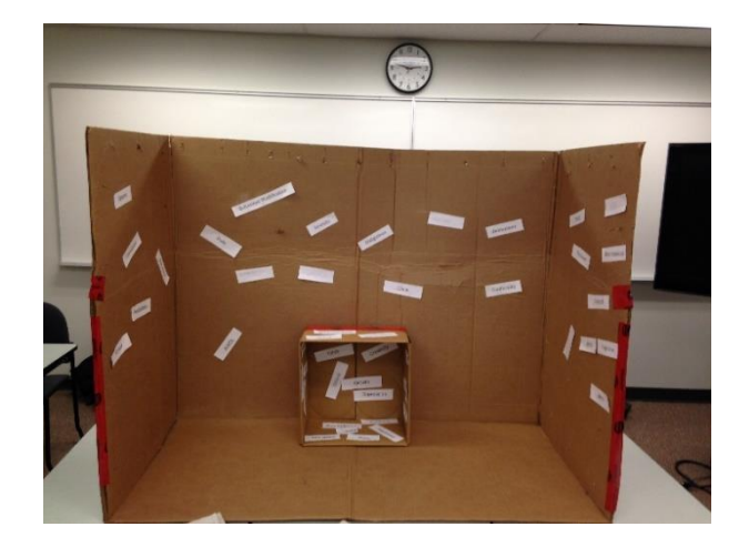
Figure 1: Boxes

The selected words represented common terminology, concepts, values, and beliefs that the researchers felt represented a CYC identity archetype and CYC praxis. Participants were given blank slips of paper with which to contribute additional words that, for them, represented CYC. Research Cohort A was than instructed to decide as a group which words most and least represented a CYC identity archetype by placing the words in two boxes labelled "praxis" and "CYC Identity." These boxes (see Figure 1) symbolized what language is common or promoted within a CYC context and which words are not, and thereby defining roles, rules, and expectations for workers within a CYC archetype.