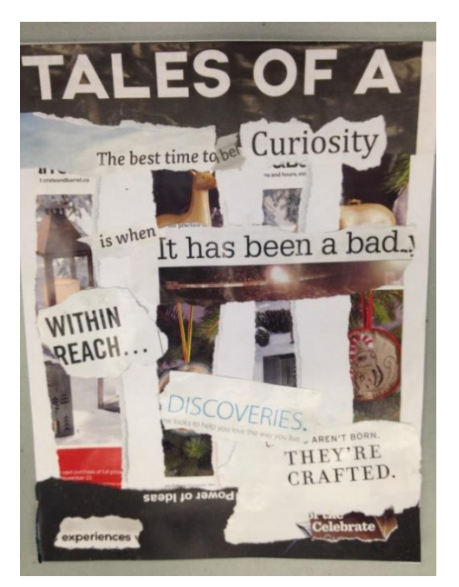
Figure 2: Example of visual collage

The researchers then encouraged participants to discuss the elements of their collage that were most sacred to them as practitioners, as well as their thoughts about what elements of their own praxis they see reflected in or excluded from the dominant discourses surrounding identity in Child in Youth Care. Through discussion, the cohort developed a loose definition of a CYC identity archetype and actively compared their expressions of praxis with that construct. The session concluded with an open discussion regarding participants' collages, the process of collage creation, and the reciprocal impact of professional identity on praxis.