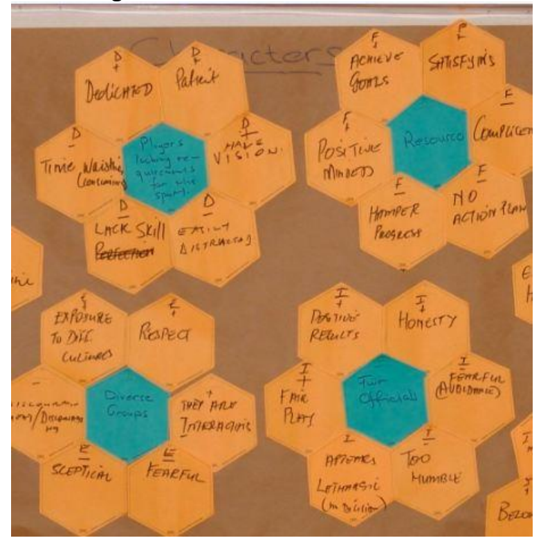
Figure 5: Positive and negative attributes of the characters