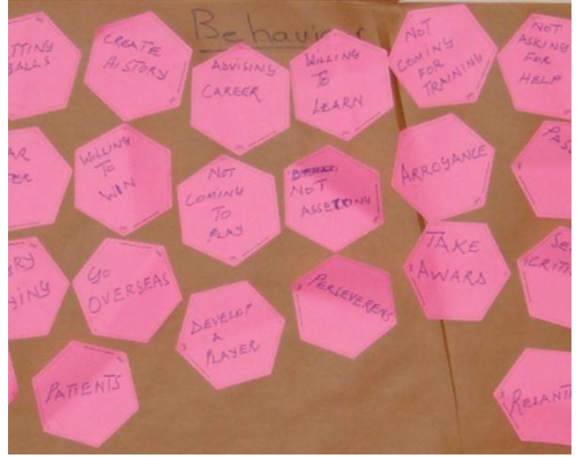
Figure 1: The observed behaviour

Volunteers assisted in extracting three data elements, namely the observed behaviour, the characters in the anecdote and the issue or subject of the anecdote on post-it notes. A data element was recorded on a post-it note, i.e. if there are three characters in the anecdote, there would be three post-it notes. Once sufficient anecdotes were collected, participants were requested to take a short break. During the break the three different data elements were then placed on separate wall panels in the room. Figure 1 illustrates the observed behaviour.