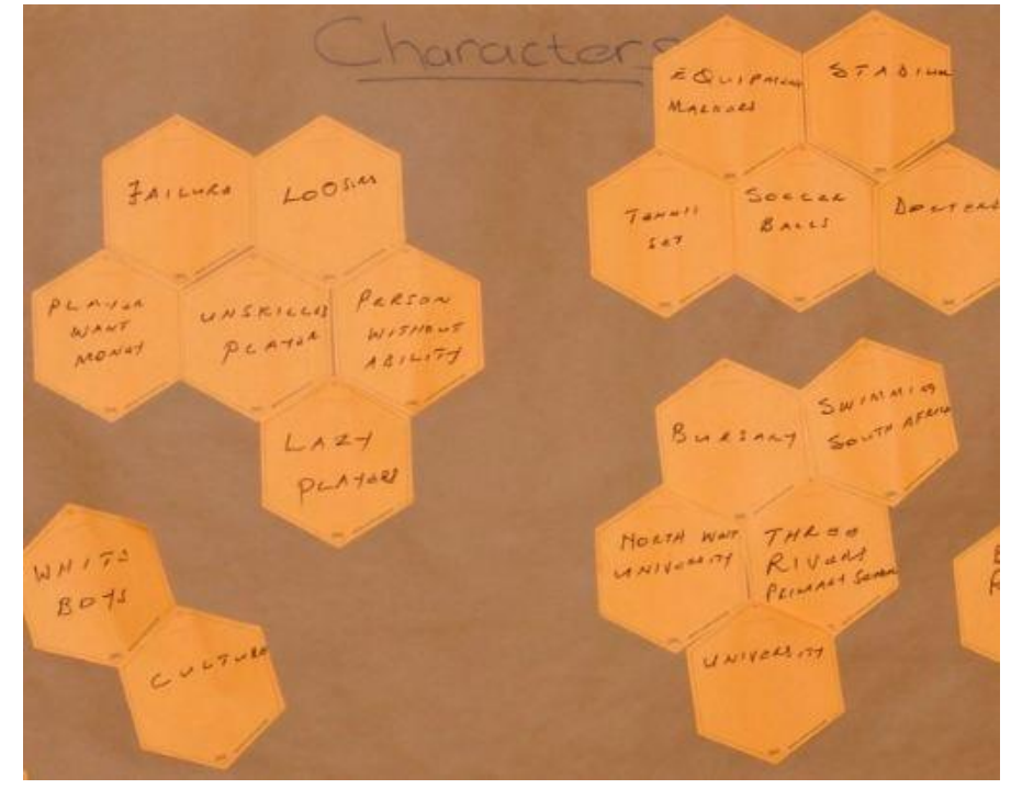
Figure 4: The character cluster

Immediately after the break participants were requested to refer to all three sets of data and assist in clustering similar ideas. The clusters were pasted on another wall. Each cluster was then provided a label on which they reached consensus. Figure 5 provides an illustration of the behaviour cluster.