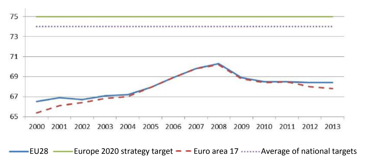
Figure 2 Evolution of employment rates in EU-28 with respect to targets of the Europe 2020 strategy (age group 20 - 64)